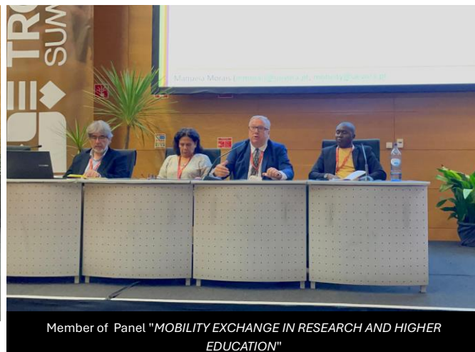
Member of Panel "MOBILITY EXCHANGE IN RESEARCH AND HIGHER EDUCATION"