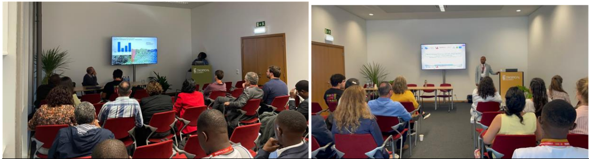
PhD students' oral presentations